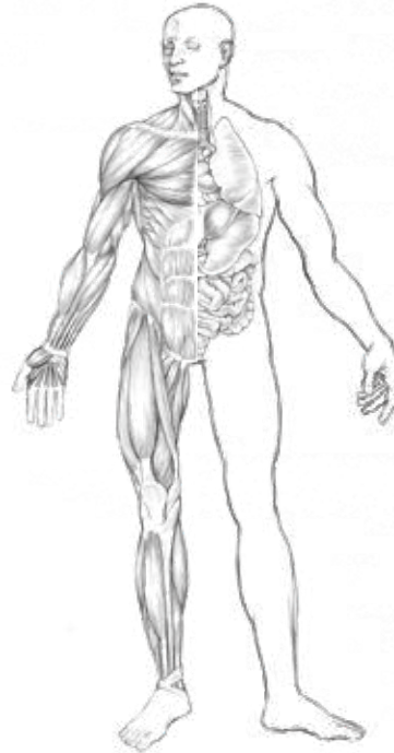
FIGURE 1. The Endocannabinoid System (ECS): An Important System for Whole Body Balance